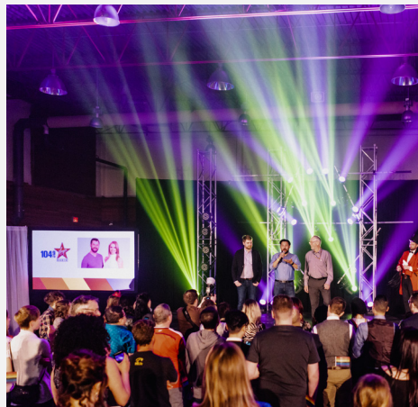
JASPER PRIDE FESTIVAL APRIL 23-26, 2020

Diversity runs deep in Jasper. Long known as gay-friendly, eclectic and open-minded, Jasper welcomes all adventurers – from backpackers, travellers, and students to the entire Lesbian, Gay, Bisexual, Transgender, Questioning and Allied (LGBTQA) community – to take part in the Jasper Pride Festival.