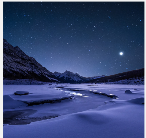
JASPER DARK SKY FESTIVAL OCTOBER 16-25, 2020

Jasper's Dark Sky invites stargazing adventurers to get lost in the wonder of one of the world's largest dark sky preserves. As daylight hours begin to recede, October is the ideal time to celebrate the skies with the annual Jasper Dark Sky Festival, an ever-growing celebration aimed at connecting all ages to our universe and beyond.