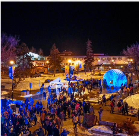
JASPER IN JANUARY FESTIVAL JANUARY 17 - FEBRUARY 2, 2020

See Jasper at its most authentic! Jasper in January festival celebrates the beauty and spirit of winter in true mountain town style: by skiing Marmot Basin, racing fat bikes, climbing frozen waterfalls, dog-sledding, and participating in signature community events such as Wine in Winter, ATCO Street Party & Fireworks, and Whiskey, Wine & Hops. So grab your mittens and make some memories!