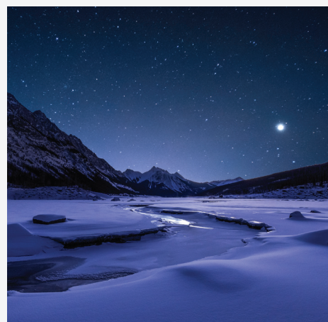
JASPER DARK SKY FESTIVAL OCTOBER 16-25, 2020

Jasper's Dark Sky invites stargazing adventurers to get lost in the wonder of one of the world's largest dark sky preserves. As daylight hours begin to recede, October is the ideal time to celebrate the skies with the annual Jasper Dark Sky Festival, an ever-growing celebration aimed at connecting all ages to our universe and beyond.