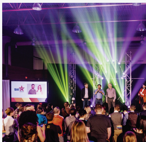
JASPER PRIDE FESTIVAL APRIL 23-26, 2020

Diversity runs deep in Jasper. Long known as gay-friendly, eclectic and open-minded, Jasper welcomes all adventurers - from backpackers, travellers, and students to the entire Lesbian, Gay, Bisexual, Transgender, Questioning and Allied (LGBTQA) community - to take part in the Jasper Pride Festival.