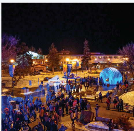
JASPER IN JANUARY FESTIVAL JANUARY 17 - FEBRUARY 2, 2020

See Jasper at its most authentic! Jasper in January festival celebrates the beauty and spirit of winter in true mountain town style: by skiing Marmot Basin, racing fat bikes, climbing frozen waterfalls, dog-sledding, and participating in signature community events such as Wine in Winter, ATCO Street Party & Fireworks, and Whiskey, Wine & Hops. So grab your mittens and make some memories!